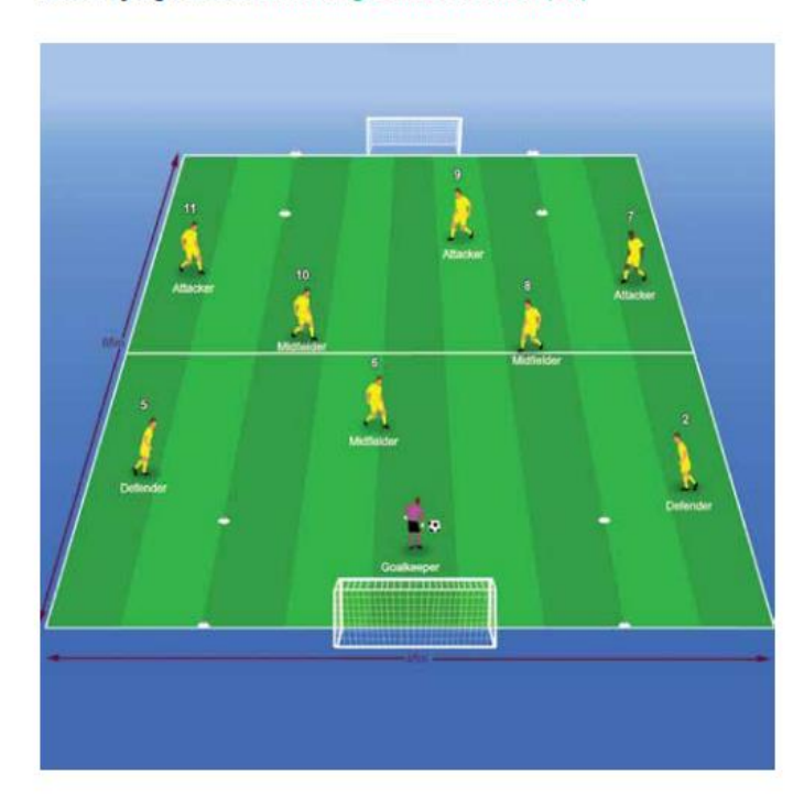
9v9 Playing Format: Attacking/Ball Possession (BP)